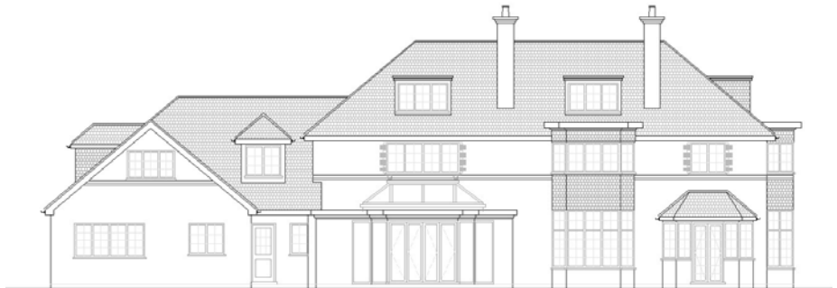
Proposed rear elevation showing new Orangery

This project required the extension/remodelling of a previously extended Arts & Crafts house to provide additional family space with an enlarged kitchen/dining/family space. In addition, a new double detached garage was required to replace the existing integral garage which was to be converted to a media room.