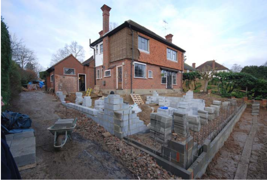
Foundations to side/rear extension and patio complete and initial blockwork underway including garden retaining walls.